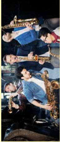
Five Sax "...simply wonderful..." – Cinemusal