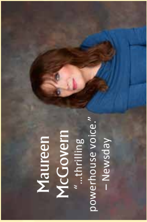
Maureen McGovern "...thrilling powerhouse voice." – Newsday