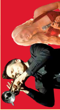
My Funny Valentine "...smooth romantic tone..." – GoldenPlec